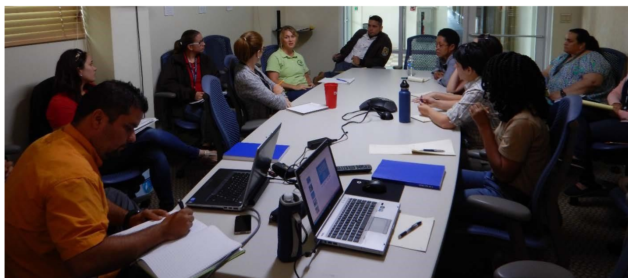
Figure 10. Project partners meetings: June 2015, J.R. O'Neal Botanic Gardens, Tortola, BVI (Top); April 2016, US Fish and Wildlife Service Office, Cabo Rojo, Puerto Rico (Bottom).

As discussed in section two and the previously in section 5.0, the partners were all involved in M&E through formal (Figure 10) and informal communications. Tracking achievements was done through direct communication with NPTVI staff and reviewed during steering group meetings (see section two). Project reports, minutes of meetings and relevant correspondence was circulated to all partners. The steering committee agreed that the M&E worked well and no changes were implemented during the project.