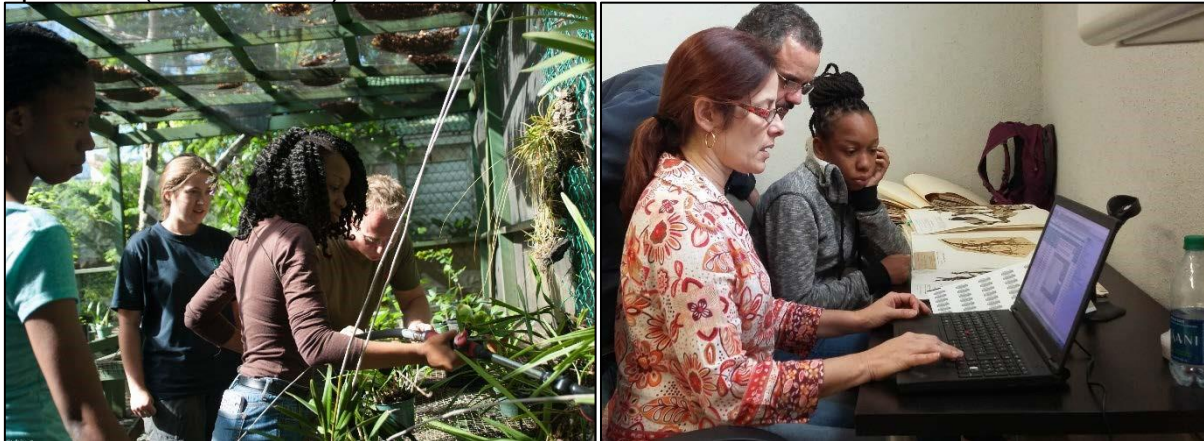
Figure 3. Training sessions for NPTVI staff: Nursery management session at J.R. O'Neal Botanic Gardens (L) and Brahms database session at SJ herbarium (R).

Kew, MAPR, DRNA and USFWS provided specialist support to build botanical capacity (Figure 3; Annexes 7, 10-17), deploy a botanical database (Figure 4; Annexes 11, 12, 16) and increase BVI's botanical collections (Annexes 14, 17, 19). The combination of expertise together with a long-standing programme of collaborative work between Kew, Puerto Rico partners and NPTVI has resulted in increased local botanical expertise and will ensure delivery of the project outputs leading to a secure future for BVI's threatened plant species. The training delivered through this project provided NPTVI staff with the skill set to implement a 'Conservation Strategy' (see Annex 6) developed by the project to enhance the ex-situ collections, monitor wild and ex-situ plant health and instigate a well-managed conservation monitoring programme as discussed in subsequent sections. We have consolidated regional collaboration and activity supported by the Puerto Rican Bank Plant Conservation Task force ( http://herbaria.plants.ox.ac.uk/bol/prvi ) which convened a workshop and meeting on 18 & 19 April 2016 (see Annex 13).