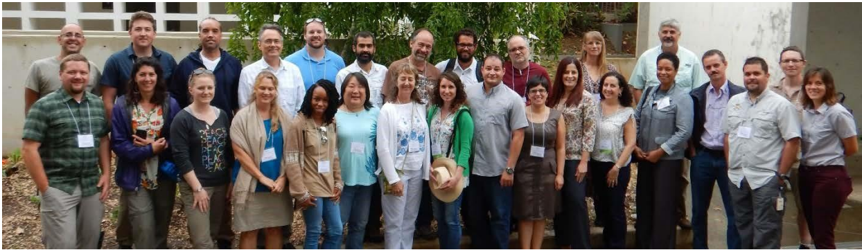
Figure 8. Puerto Rican Bank Plant Conservation Task force workshop participants on 19 April 2016 at FLMM.

A key outcome of this project – threatened species conservation strategy – has helped to embed good environmental decision-making, a key strategic priority for the BVI Government, by providing current species distribution and population size data for the BVI National GIS. This, in-turn, provides the opportunity for planning applications to be compared with threatened species locations and management or mitigation recommendations to be made.